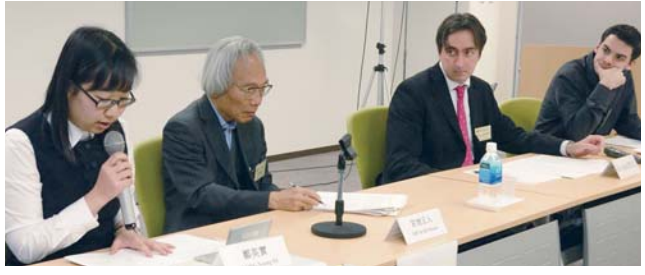
Presentors and Commetators of Session 2

In the past two forums, there had also been many attendants from domestic as well as outside of Japan including those who presented papers, without mentioning ICIS participants. It was, however, characteristic for this third forum that it was mainly participated by researchers those who embodied "the cultural interaction of present-day" by themselves. For instances, there were people those who actively devoted themselves into research activities in mainland