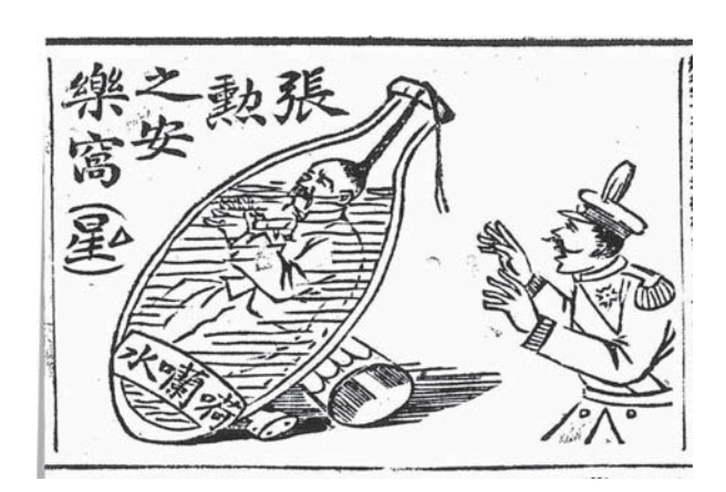
Caption: 15th of July in 1917, from Kuaihuolin, the auxiliary for literature of Xinwenbao. (author: MA Xingchi)

A surge that modern China has come across when it encountered with newspaper can be understood as a product from cultural interaction. It is the moment of the birth of a new trend when people came across with a new culture.