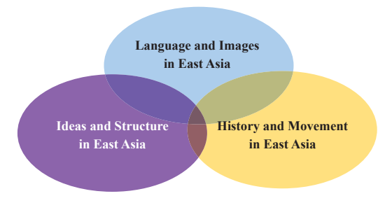
Three research areas in the department of t East Asian cultural Studies

Research students in this newly established department will focus on substantial themes for their own research projects from one of