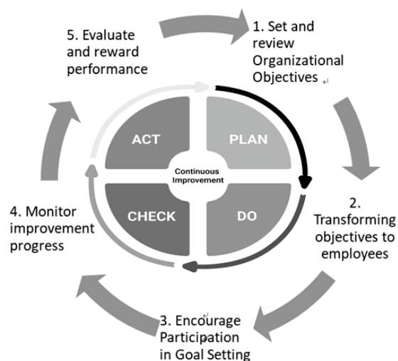
Figure 1. The Hoshin kanri process

Figure 1 outlines the basic model demonstrating how the Hoshin kanri is executed, focusing on the PDCA cycle. Each stage has particular challenges that need to be addressed for the whole system to work effectively. These steps are explained below.