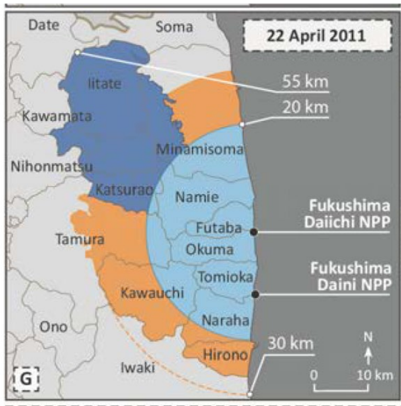
Fig. 1. Exclusion zones as of April 22, 2011.