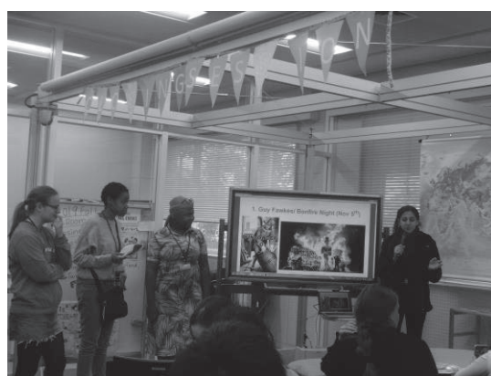
Fig. 3 Special Event – Introducing Guy Fawkes

English-mediated content-centered special sessions are one-off events and are received very well by participants. The range of topics covered is wide. Some of the sessions that were offered were: Visual Writing, American’s Four-Course Meal, Broadway: Musical Theatre, How to Behave in South Korea: Table Drinking and Business Manners, British Small-town Life and Culture, An insight into Punk and Hardcore Subculture, Fantastic French Sweets, Welcome to the World of K-POP! Explore the Secret of Egyptian Hieroglyphs, Taiwan Night Market Culture, Introducing Guy Fawkes, and Local Attractions in Malaysia!