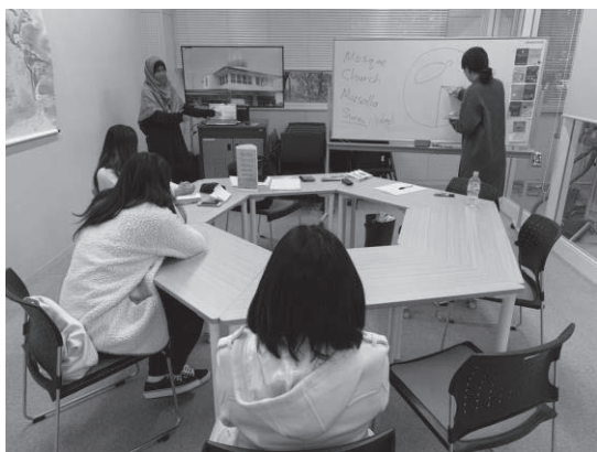
Fig. 1 English-mediated content-centered session - English Through Culture Session “Religion in Malaysia”